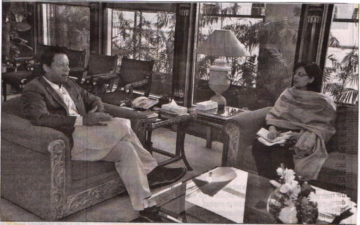
ISLAMABAD: BISP Chairperson Sania Nishtar calls on Prime Minister Imran Khan at PM Office, Monday.